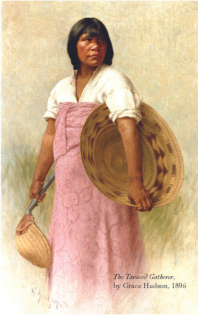
The Tarweed Gatherer, by Grace Hudson, 1896